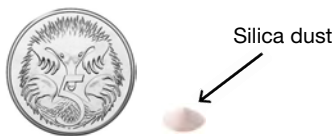
Figure 3: Breathing in more than the amount of silica dust shown in this picture, per day, means you have exceeded the exposure limit of 0.1mg/m 3 .

The mandatory limit for silica dust exposure in Australia is 0.1mg/m 3 averaged over an eight-hour day. The ACGIH have recommended the threshold limit value be 0.025mg/m 3 over an eight-hour day. This limit was based on the prevention of lung cancer and silicosis. However, there is currently no evidence to suggest a safe level of silica dust exposure. Work Health, and Safety (WHS) Regulation 50 states air monitoring (by an occupational hygienist ) must be conducted if there is a possible risk to health or if there is potential of exceeding the exposure limit. However, exposure levels in settings like construction sites are always changing and air sampling alone is not enough.